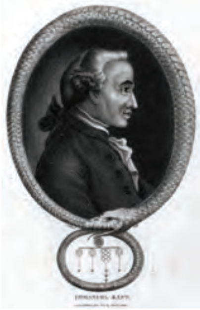
The German philosopher Immanuel Kant (1724-1804)