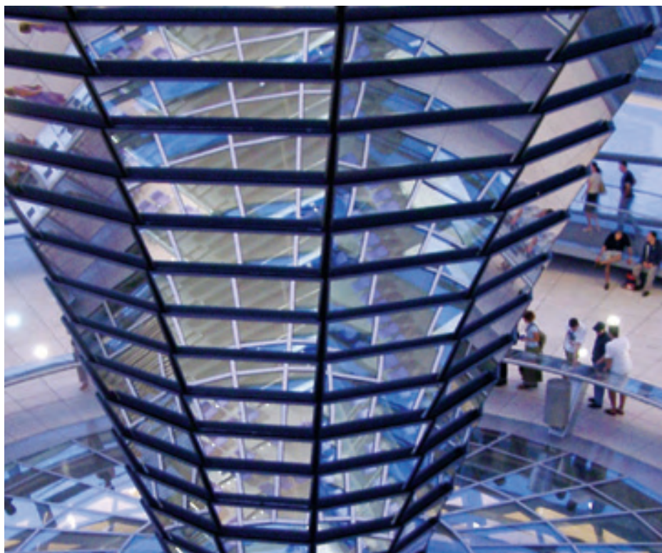
The German Parliament building in Berlin: European politics is an important part of the Contemporary European Studies degree programme